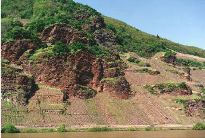
The Erdener Prälät vineyard