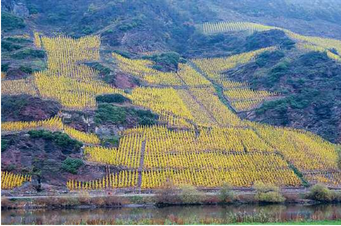
The Erdener Treppchen vineyard