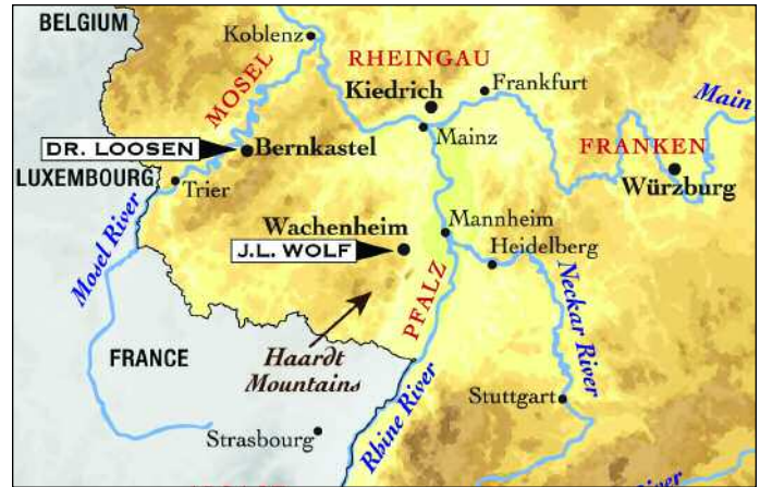
Bernkastel is in the middle Mosel valley, about half way from the French border to the river's confluence with the Rhine, at Koblenz.