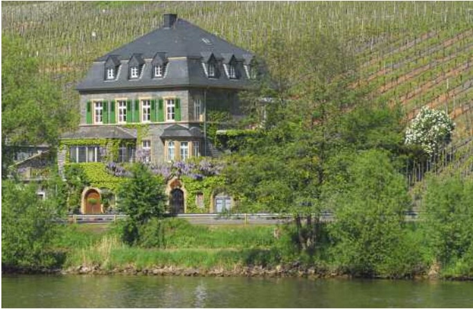
The Dr. Loosen estate house is on the Mosel River, just downstream from the village of Bernkastel.