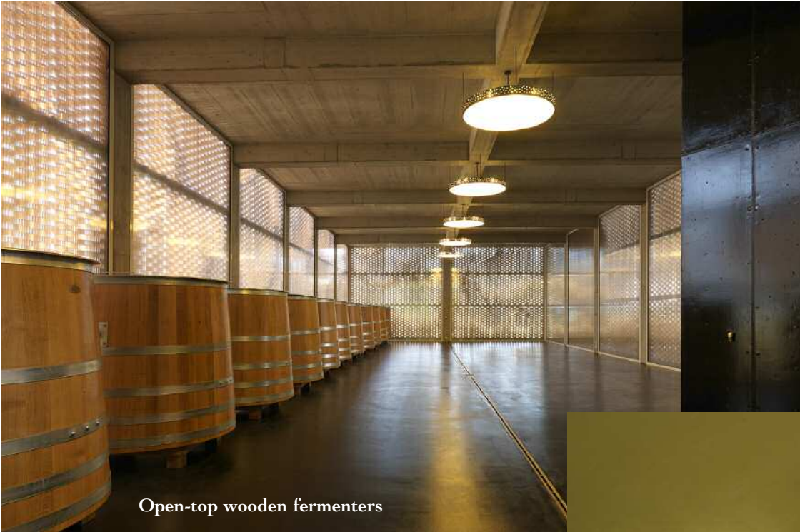
Open-top wooden fermenters