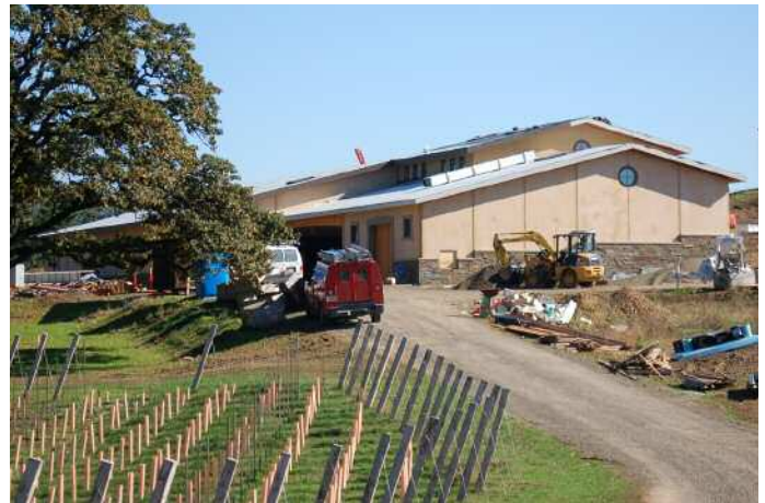
The J. Christopher winery building, nearing completion in summer 2011.