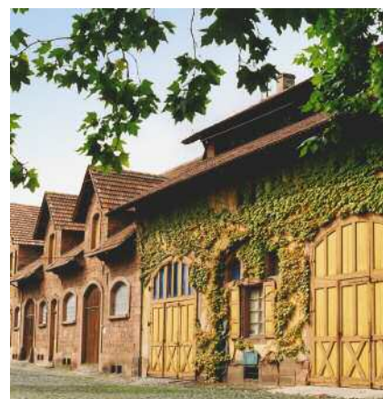
The Italianate winery villa at J.L. Wolf.