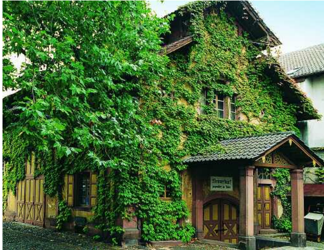
J.L. Wolf wines are made in the 19th-century winery building at the historic estate in the village of Wachenheim.