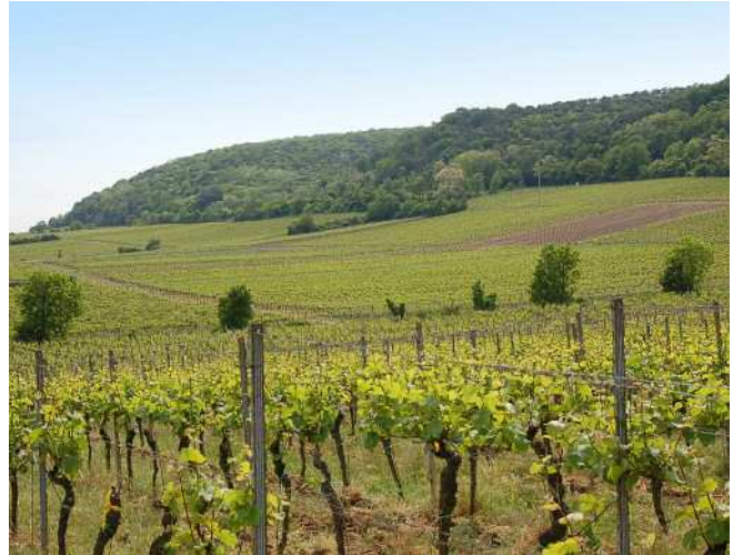
The gently sloping vineyards of the Mittelbaardt are protected by the low-lying Haardt mountains.