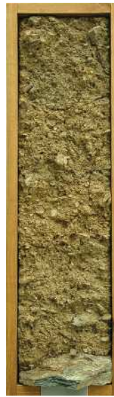
Gräfenberg soil profile