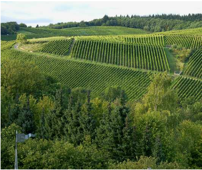
The first-growth Kiedrich Gräfenberg vineyard