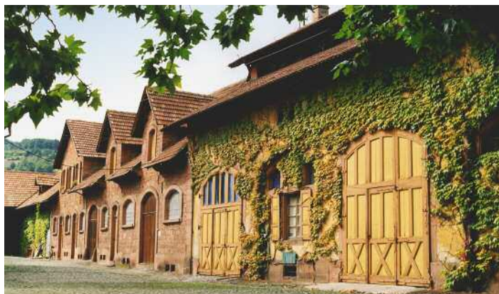
The winery portion of the Italian style villa at J.L. Wolf.