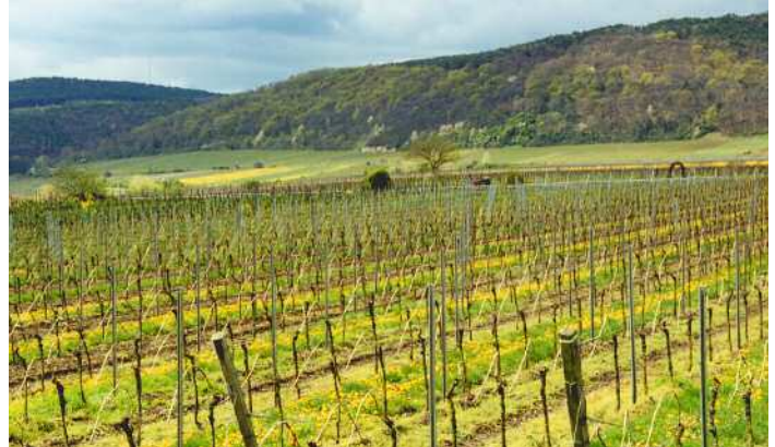
The gently sloping vineyards of the Pfalz region in the broad Rhine valley of southern Germany.