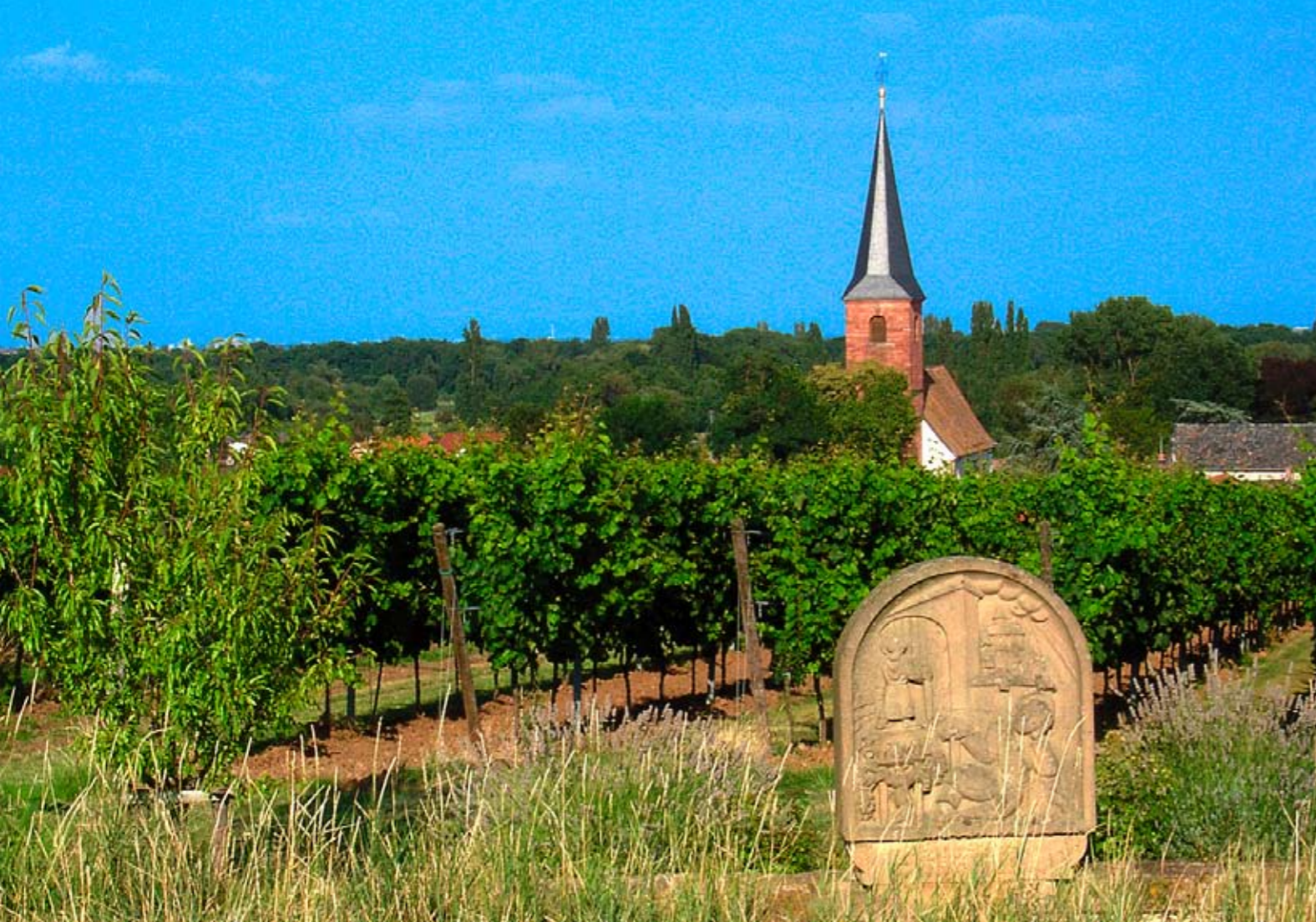
Above: a carved stone testifies to the longstanding reputation of the Forster Kirchenstück vineyard in the Pfalz, where several top growers have holdings. Right: greater respect for the vineyards has encouraged more sustainable viticultural practices, including plowing by horse to avoid compacting the soil